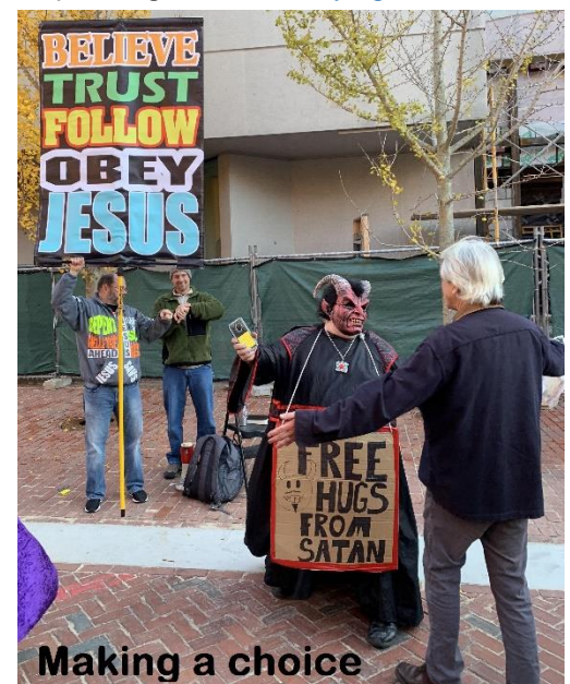
Making a choice

I fear that the creationist conspiracy theory will not be so short-lived. It is driven by a deep-seated power struggle within religious communities, between modernists and literalists; between those who regard scripture as coming to us through human authors, however inspired, and those who regard it as a perfect supernatural revelation. And that is a struggle that will be with us for a long time to come.