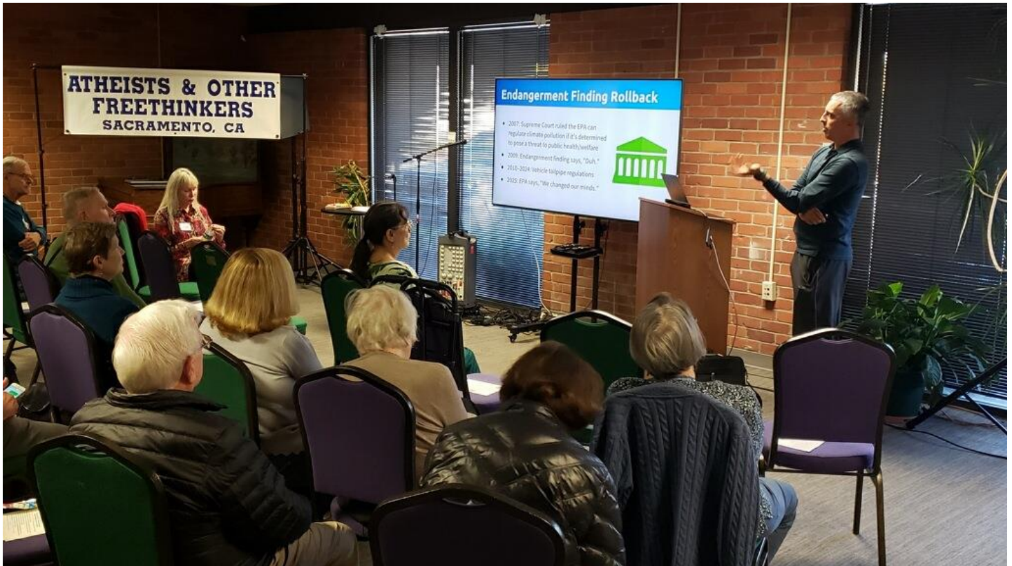
November 23, 2025 AOF meeting – "Doom, Gloom, and Energy Boom"